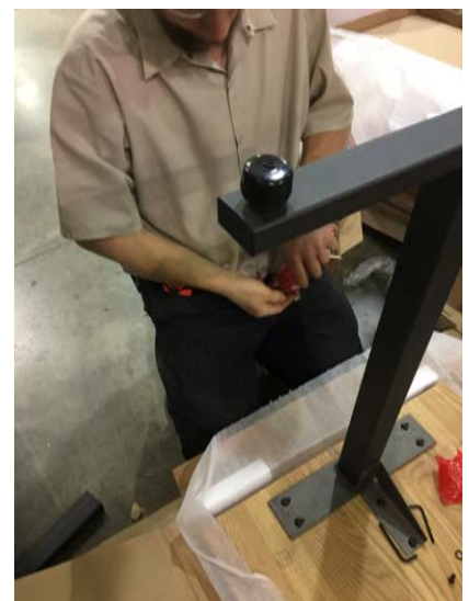
Complete your assembly