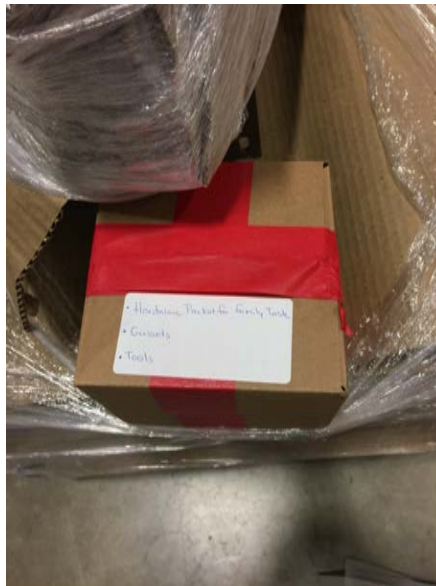
Gussets are packed separately as shown.