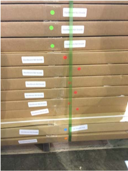
Note color coded dots and hardware indication on table base packaging

Table top packaging is done to assist in ease of assembly as you can see below.