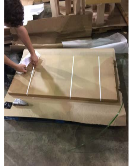
Place table top down with the tape seam facing up. This places the face down and the installation area up and protects the table face during assembly.