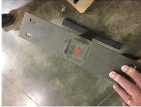
The dots correspond to the proper bases, which also have color coded dots