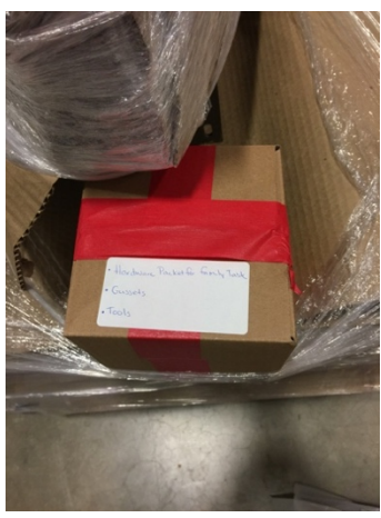
Gussets for table bases packaging