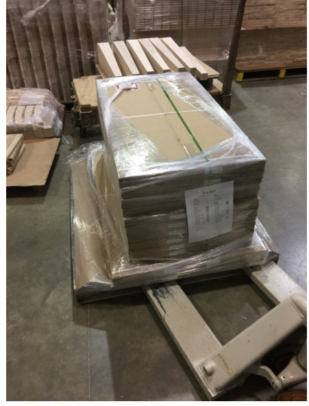
Typical table top pallet