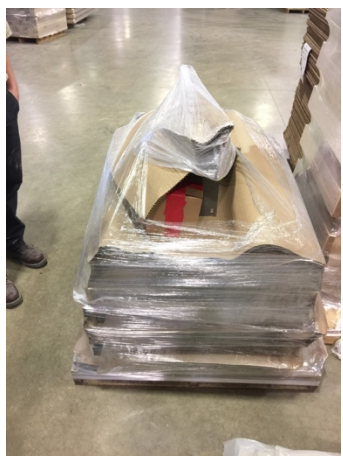
Typical Pallet of Table bases & Parts

The packaging of furniture for this program is documented below for your review.