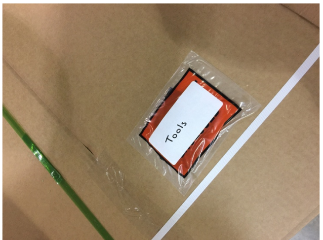
Tool packaging for table base assembly